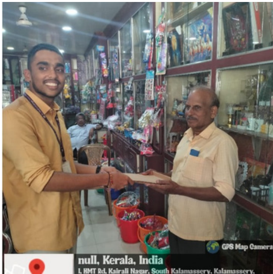
null, Kerala, India 1, HMT Rd, Kairali Nagar, South Kalamassery, Kalamassery.