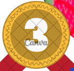
ABHIRAMI T B (Co-operation)