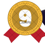
SARATH S NAIR (Co-operation)