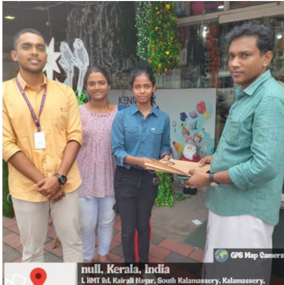
null, Kerala, India 1, HMT Rd, Kairali Nagar, South Kalamassery, Kalamassery.