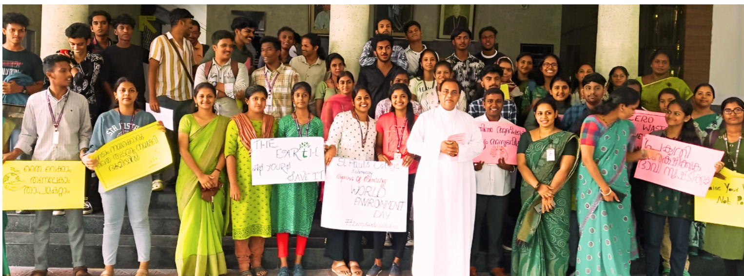
The students of the Department of Chemistry initiated a public awareness campaign focused on plastic waste